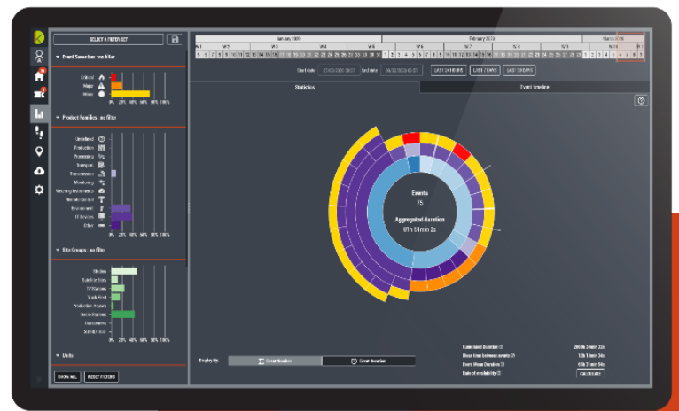
Legend: KYBIO analytics module

In the back-end, KYBIO identifies the real path of each signal and on the front-end, displays the path dynamically on the dashboard . This complex operation is possible with the aggregation of several types of data by KYBIO; QoS, QoE and network information is gathered from third-party probes and analyzed by the software to create the current working path. Before KYBIO, it was not possible for this IPTV provider to identify information concerning the real path of each channel. Thanks to KYBIO, this is now a challenge overcome!